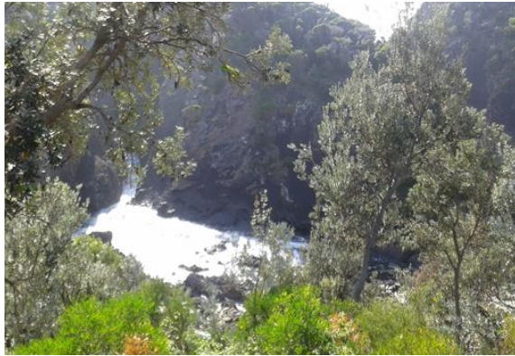
Field trip To Smiths lake