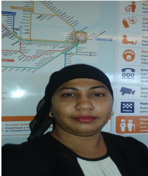
Train ride to Macquarie University