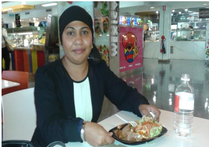
lunch at Macquarie