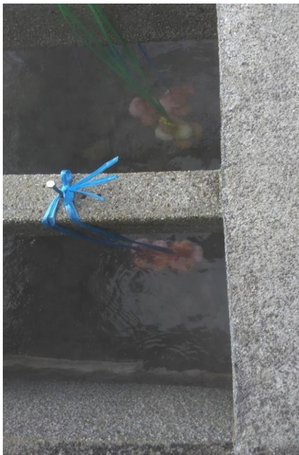
Fig 1: Boiling eggs at the Hot Spring.

Homestay at the Shin'Onsen city was the most interesting part of the trip as I get to meet and interact with very important delegates such as the mayor and his deputy, the city's chairman of the International Exchange Association. This shows how respectful the Japanese people are no matter their different backgrounds, they all demonstrated the same level of respect. Another fascinating experience is getting to bath in the Onshen daily with my host mother and sister and enjoying the drive up the mountain to where my host family lives and seeing deers. Visiting and boiling eggs in the city's hot spring was delicious and was wonderful and refreshing to actually bath from the natural hot springs pumped from underground. Feeling and adoring the beautiful mountain scenery covered with snow was just overwhelming. Amazingly yet, my host mother and sister took me to visit Totori City, Totori Sand Dunes and Illumination and Totori Sand Museum which was just so spectacular. This was my first time to actually see sand sculpture in reality.