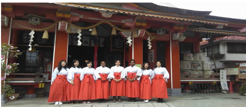
Fig 6: Being Shrine maidens at the Shinto Shrine