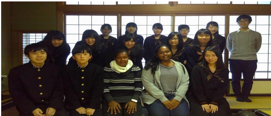
Fig 5: Hamasaka Senior High School visit