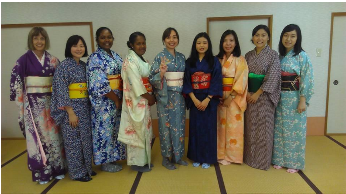
Fig 7: Us in our Kimonos