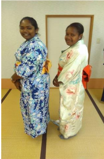
Fig 3: Kimono Fitting

The Kimono fitting, tea ceremony, the elementary and high school visit, was a lifetime experience not to forget the Shinto shrine and having the experience to be shrine maidens for a few hours, attending origami class and enjoying the diverse Japanese dishes, the Japanese way. Obviously Japan is one of the leading countries in advanced technology but still implements a very rich and active culture. As an exchange student, I am very proud to be given the privilege to participate in these traditional Japanese activities and to enjoy them.