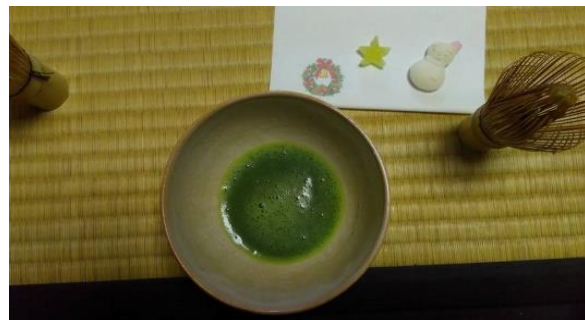
Fig 4: Preparing traditional Japanese tea